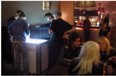
Figure 3: Tangible tabletop interaction in a night club [1]