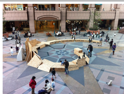
Figure 4: Interaction with a media arts installation (by Alvaro Cassinelli and Danielle Wilde, 2011)