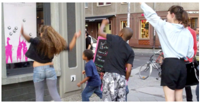
Figure 1: Public display interaction [10]